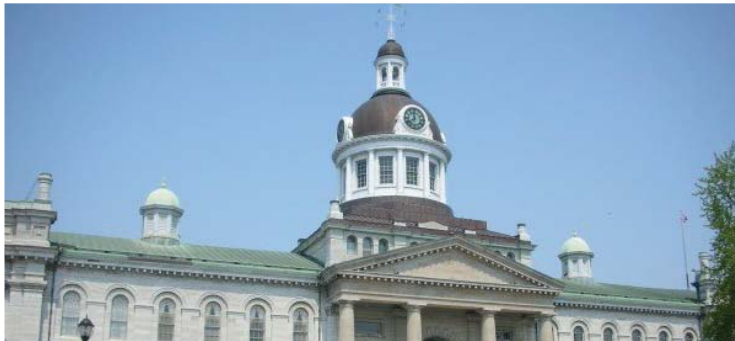
加東五/六天豪華遊 Canada East Coast 5/6 Days Tour [CEC05/06]