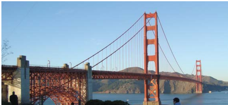
美國西岸四至十天遊 U.S. West Coast 4-10 Days Tour [P4-10A]