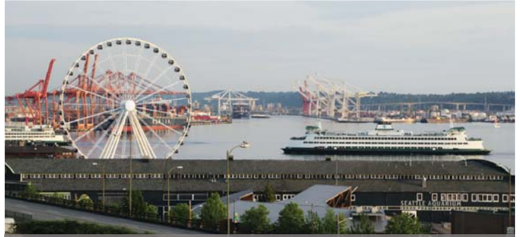
金裝華盛頓州·火車·波音·博覽兩天遊 Washington State Boeing & Amtrak Train 2 Days Tour [SEA02]