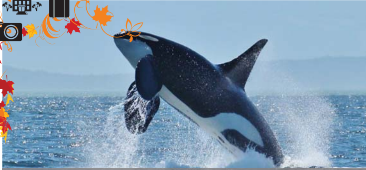
溫哥華島·杜芬奴·觀鯨·生態兩天遊 Vancouver Island & Tofino Whale Watching 2 Days Tour [TOF02]