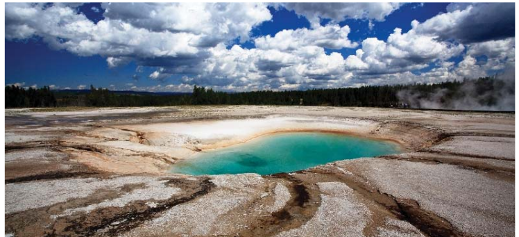
黃石國家公園六天遊 Yellowstone 6 Days Tour [YEL06]